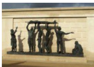
A Memorial at the National Arboretum