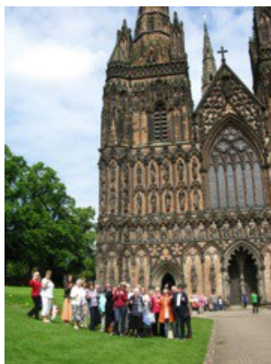
Friends gather outside Lichfield Cathedral.